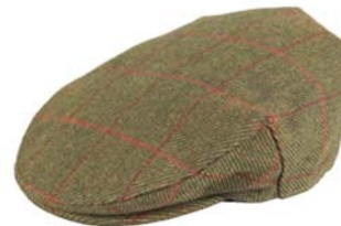
Dark Green 5907/5I