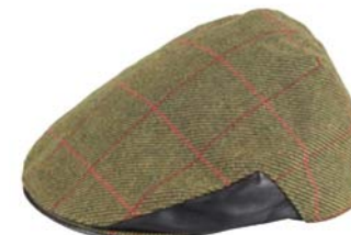
Dark Green 5907/5I