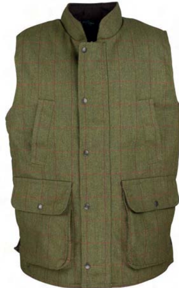
Dark Green 5907/5I