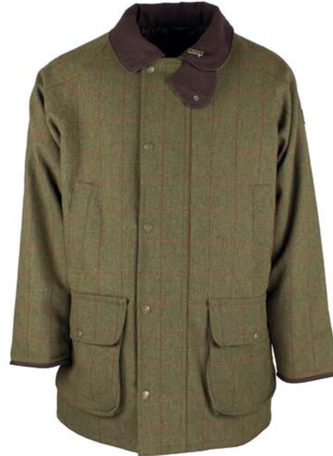
Dark Green 5907/5I